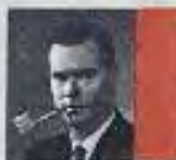
WOMAN LINCOLN ROCKWELL MARCH 1964